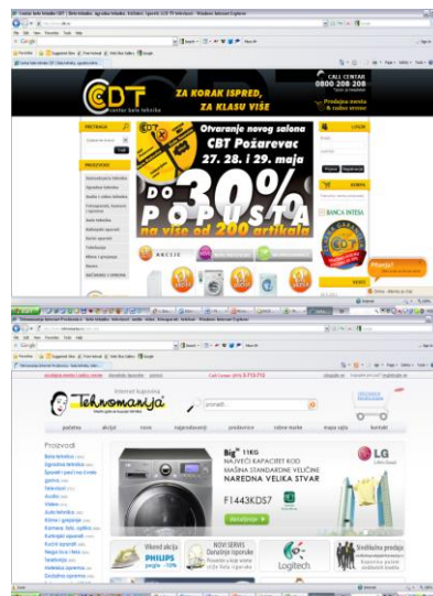
Figure 1. Websites of manufacturers and distributors of home appliances

other countries (CBT, Tehnomania, Tehnomarket, Samsung, Philips ...), [6-11].